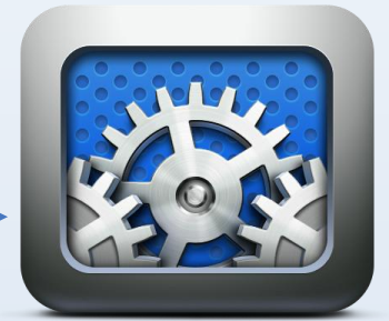
Existing Claims System